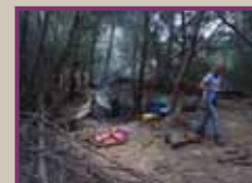
Northern Natal scouts experience the thrill of Backwoods camping during a combined 3rd Newcastle and 1st Ladysmith camp.